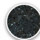
With granite build platform